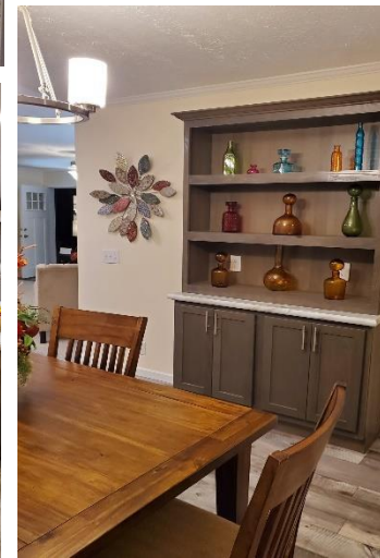
Skyline 28x60- House #9- Charleston Home Center